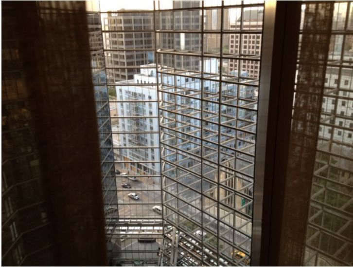
Omni Austin downtown view

These suites are quite the sweet hospitality arrangement - and I felt lucky to be able to indulge for an evening! These suites range from $499-$799, depending on dates and availability.